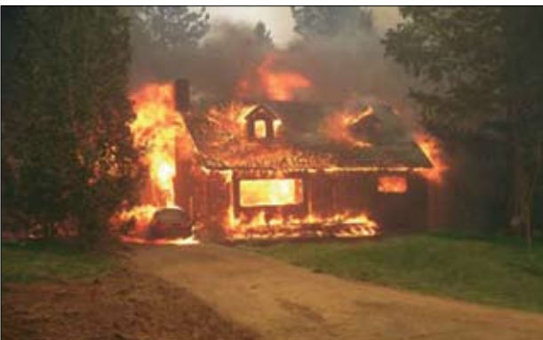
This house was ignited by burning embers landing on vulnerable spots. Notice the adjacent forest is not burning.

Maintain wooden fences in good condition and create a noncombustible fence section or gate next to the house for at least five feet.